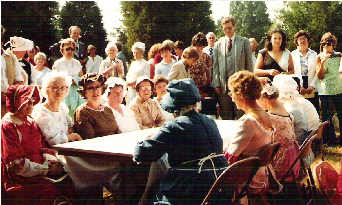
Members sat at tables and were served by the elders and former Fairfield pastors