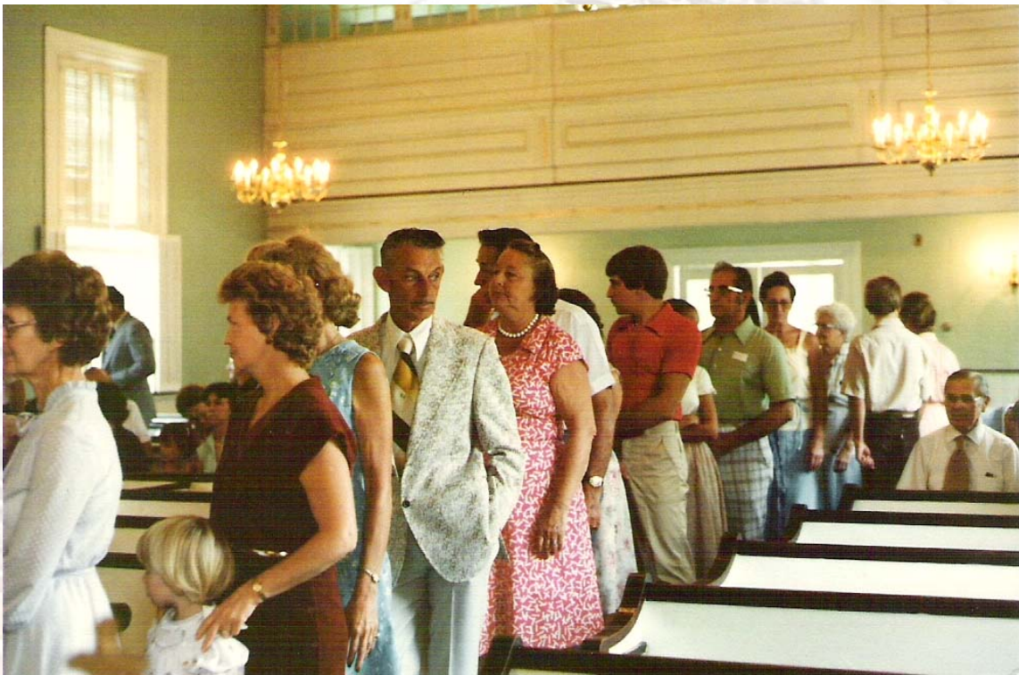
Fairfield members line up for their tokens