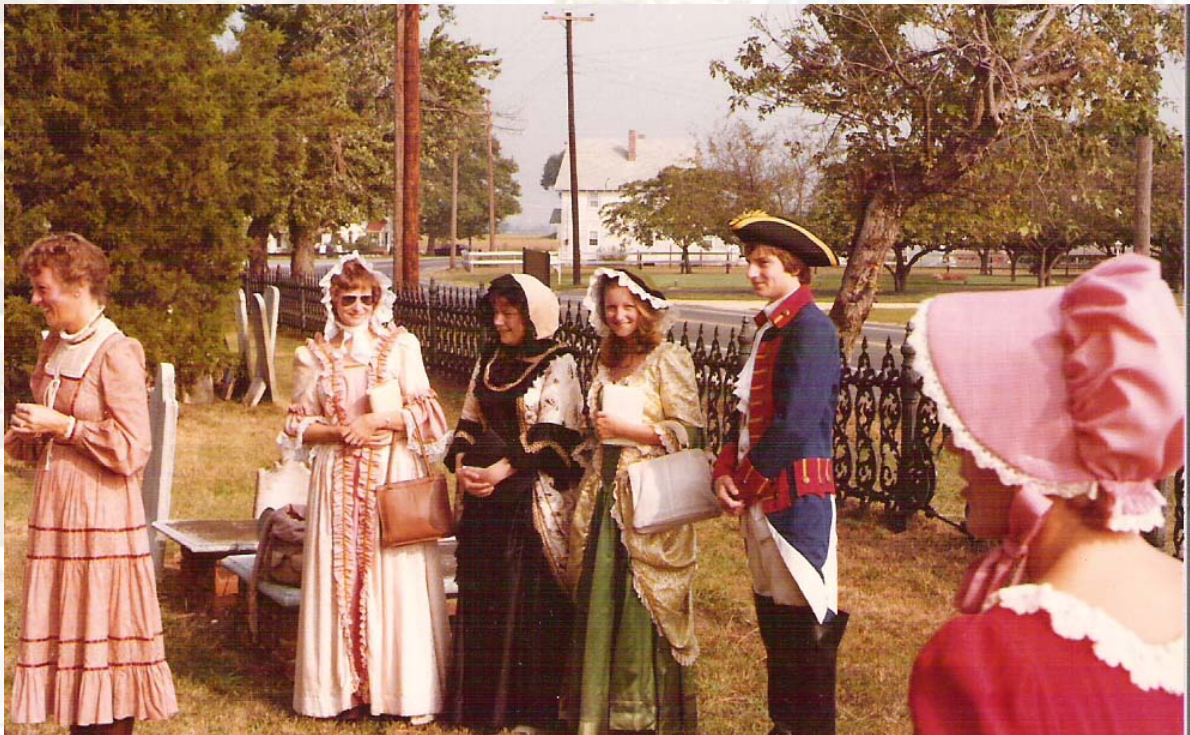
Fairfield members dress in period costume.